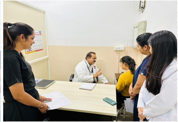
MGH Physiotherapy OPD