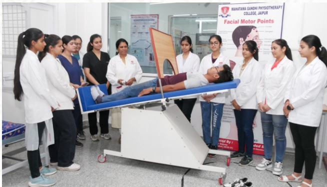
MGH Physiotherapy Labs