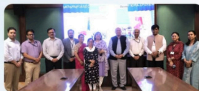
Honoring a Milestone in Education and Communication