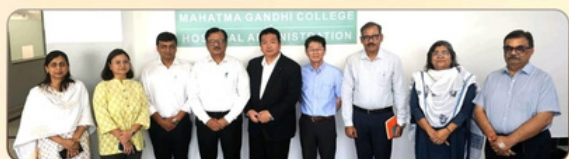
MGCOHA Placement Drive Welcomes Indo-Japanese Industry Leaders

TOLL FREE NUMBER - 18001806002 | 8107677888