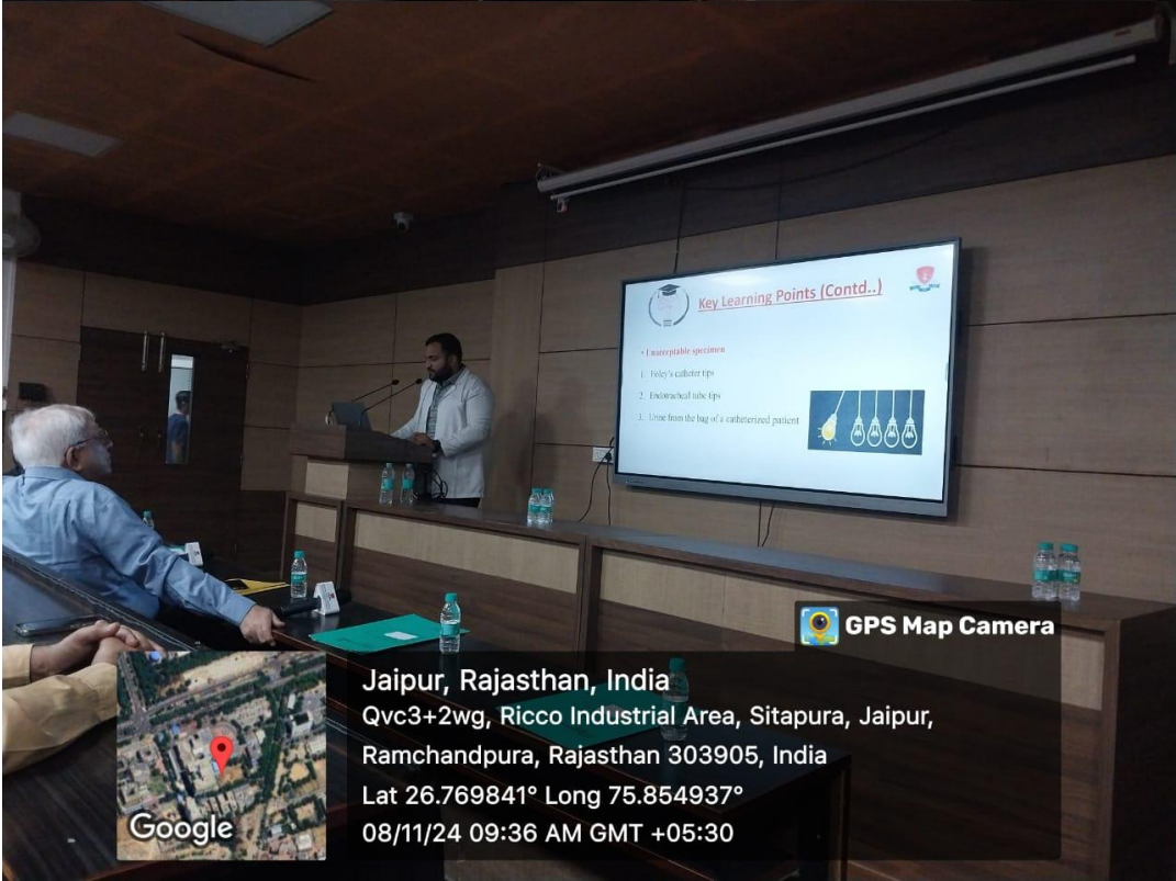
10. Presentation by Residents